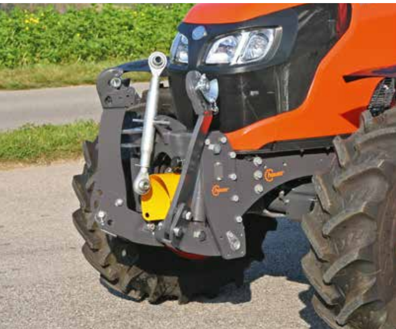
front linkage FSK-18 with good ground clearance